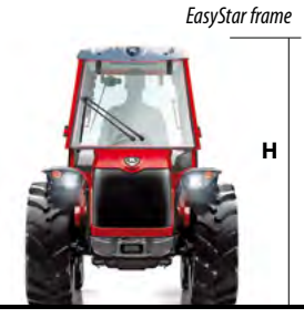
*Height calculated with the operator of average height sitting (cm 175)