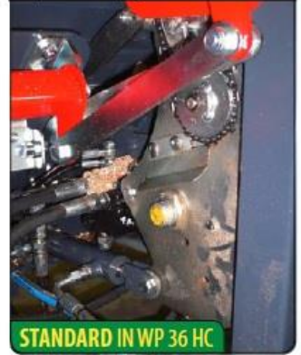
Hydraulically operated chainsaw