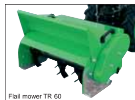
Flail mower TR 60